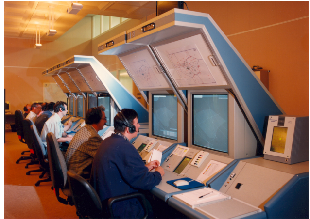
Figure 1: Control room and controller working position at the EUROCONTROL Experimental Centre (recording site)

In most air traffic control centres the controller pilot radio communication is recorded and archived for legal reasons. However, these legal recordings are problematic for a corpus production for a multitude of reasons. First, most recordings are based on a received radio signal and thus not wideband. Second, it is in general difficult to get access to these recordings. And third, even if one would obtain the recordings, their public distribution would be legally problematic at least in many European countries.