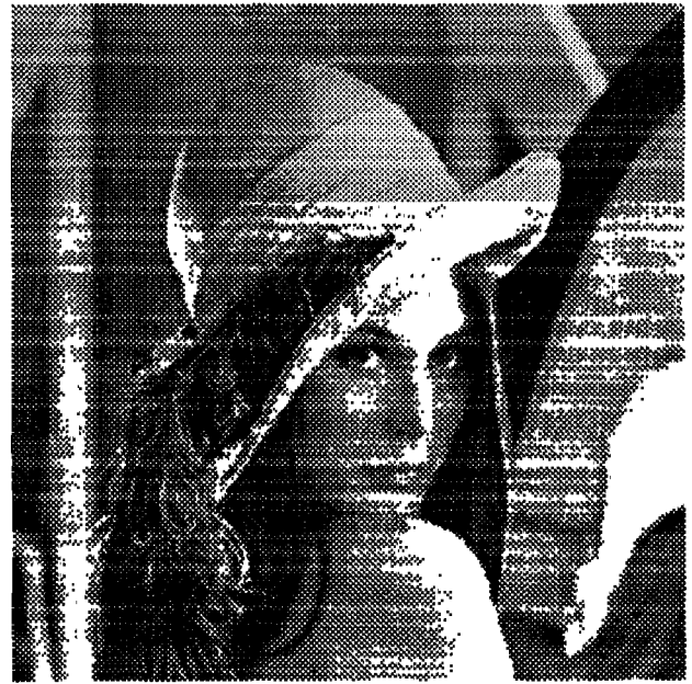
Figure 2. The JPEG encoded "Lena" at 0.25 bpp

The discontinuity at all the block boundaries can be simply lowpass filtered. The mask for this filter [5] is shown in