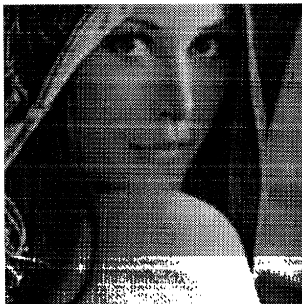
Figure 6. "Lena" - After Post Processing - 0.25bpp