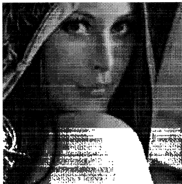
Figure 5. "Lena" - Before Post Processing - 0.25bpp