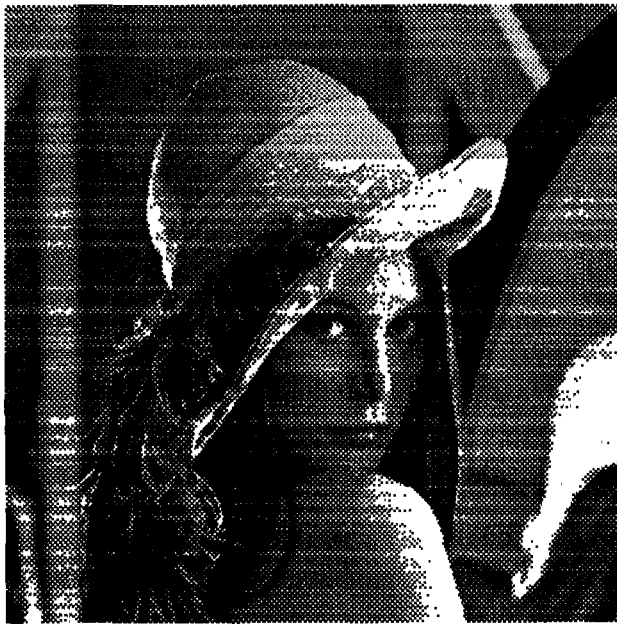
Figure 1. The Original "Lena" Picture

After a series of experiments, we choose